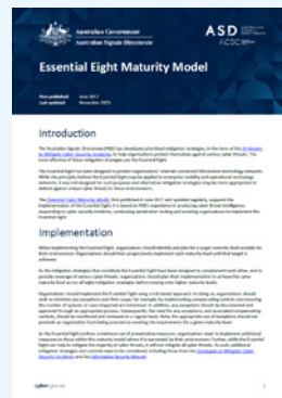
Essential Eight Maturity Model