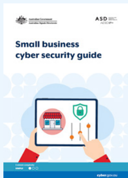
Small Business Cyber Security Guide

For more information on how to improve your cyber security, see our other guides at cyber.gov.au